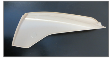
An elbow support door panel, 3D printed on a Fortus 400mc 3D Production System in tough ULTEM 9085 resin.

"At the moment Stratasy's technology delivers the fastest and most economical means of constructing prototype parts for us," he concludes.