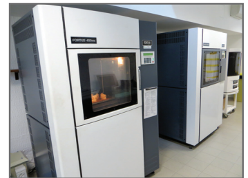
The Fortus 400mc 3D Production System produces parts that include Nolders, an aerodynamic profile installed under vehicle bumper.

Serrazanetti adds that the 3D printer fulfills the need to create high-performance aesthetic parts like profiles and air conduits. "In the motor racing world, the capability to very quickly output highly durable parts and components within a seemingly unlimited design scope offers an unprecedented advantage."