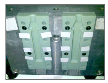
PolyJet printed molds mounted on Plasel's blow molding machinery.

Plasel decided to use a 3D printed PolyJet mold to produce blow molded prototypes. After making a few minor design changes to accommodate the differences between PolyJet materials and aluminum, the new mold was ready to use a day later. The next day, Plasel was able to blow mold the 100 prototypes and send to their customer for testing. Upon receipt, the customer validated the fit, function and appearance of the prototypes as well as their compatibility with the conveyor system; they all worked perfectly.