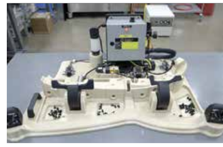
Automotive assembly jig built in ULTEM™ 9085 and FDM Nylon 12™ material.

Stratasys 3D printing technology enabled Solaxis to continuously improve the jig, saving the customer production time and money. In turn, the automotive supplier has significantly increased the reliability of the door seals it provides to its OEM customer. With zero compliancy issues the last two years, that means higher profits for the company.