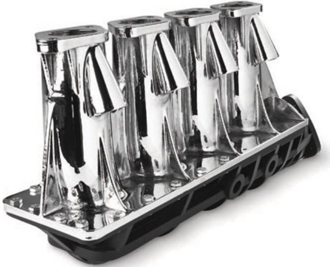
Electroplated FDM manifold

Electroplating deposits a thin layer of metal, such as chromium, nickel, copper, silver or gold, on a part's surface. The electroplated coating gives the appearance of production metal and provides a hard, wear-resistant surface with reflective properties. Prior to plating, FDM parts need to be sanded smooth and sealed with either a vapor smoothing process, solvent dipping or paint to aid chemical adhesion.