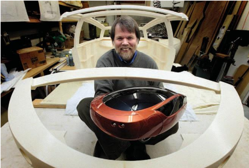
Urbee is an Eco-friendly vehicle that was 3D printed in sections and bonded together

Cyanoacrylate, also known as Super Glue, is a popular fast-curing adhesive applied for light-duty bonding applications and repairs.