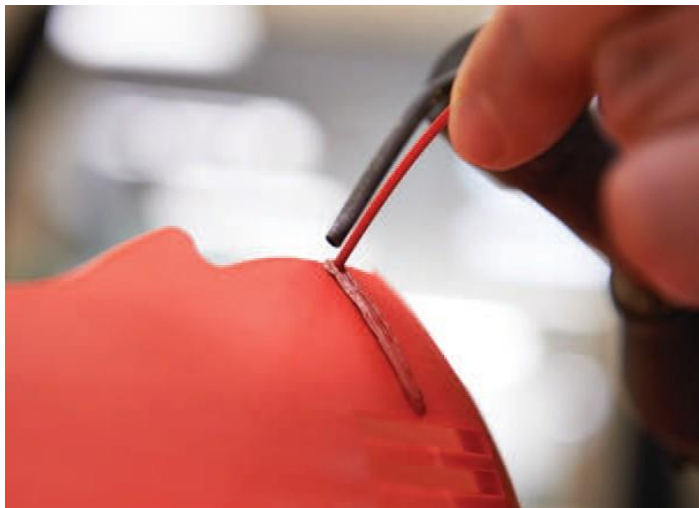
Hot air welding a seam with FDM thermoplastics

Hot air welding allows you to create parts larger than the machine build platform. A CAD design is split into separate parts with dovetail joints which are built on separate 3D printers and then welded together after printing. A hot air welding tool is slowly drawn along the joint to melt the filament, which then fills the seam. An advantage of hot air welding is that it does not add any foreign material to the part— it uses the same model thermoplastic. For example, instead of gluing flame-retardant ULTEM material with epoxy that could potentially be flammable, it is bonded with ULTEM, preserving the overall mechanical properties of the part.