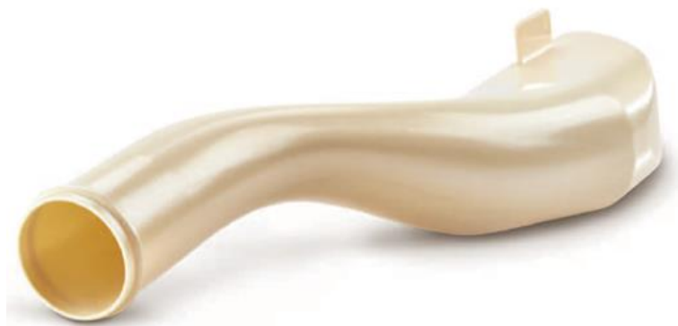
Tumbled ULTEM 9085 air duct

Mass finishing is most commonly found in the metals industry to process and polish metal parts, but Stratasys has developed vibratory methods to apply the same technique to plastics using softer media. The parts are placed in a vibratory unit filled with either ceramic, plastic, synthetic or corn cob media, in which the machine rotates for several hours until the media burnishes the surface.