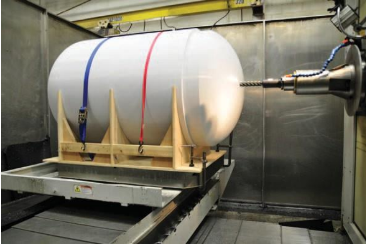
Lockheed Martin fuel tank simulation built in 10 sections, hot air welded together and machined to the design's critical dimensions

CNC machining is typically used to mill a part out of a block of material. But with complex, additive manufactured parts, machining can function as a secondary operation to achieve very specific dimensional tolerances that cannot be met with 3D printing alone. It's also often used to add threads for inserts.