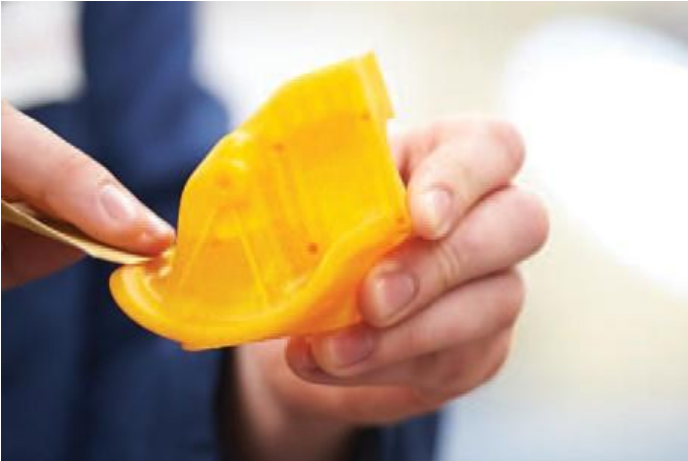
Hand sanding an ABS part

Plastic parts made with FDM can be sanded by hand or with orbital sanders to remove the stair-stepping effect that is inherent to the process. Finishing experts use a variety of grits to smooth the surface to the desired aesthetic.