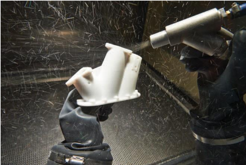
Media blasting a PC-ISO part

Media blasting is a faster alternative than sanding to smooth the surface of a part and it is often an easier way to reach small features or internal channels. Media blasting is performed with a spray gun and plastic media that is blasted on a part's surface at up to 30 psi.