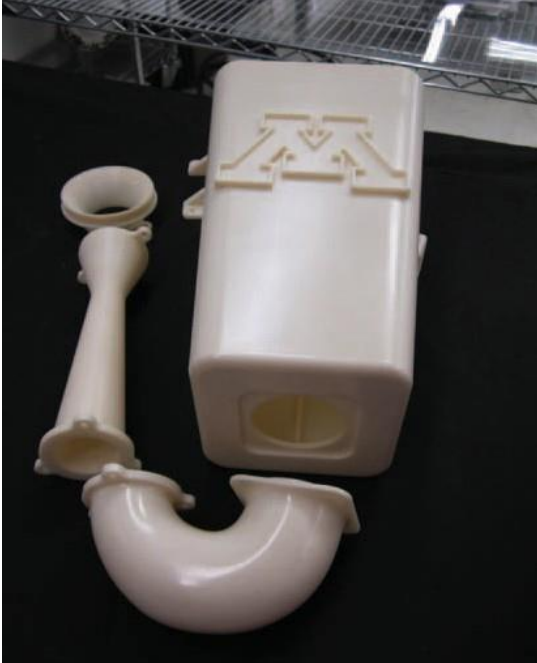
Epoxy sealed intake valve for the University of Minnesota, College of Science and Engineering's Formula SAE vehicle

FDM parts are naturally porous right off of the machine which presents an obstacle for containing gases and liquids. The solution is sealing the part with a water or chemical resistant epoxy coating. Vapor smoothing also seals part surfaces, but is limited to applications no higher than atmospheric pressure. Two-part epoxy brushed onto the surface of a part generates an airtight seal and is resistant to many chemical agents. The other option is immersing FDM parts in epoxy resin and using a vacuum to infiltrate the epoxy to create a watertight seal and resistance to chemical agents and high temperatures.