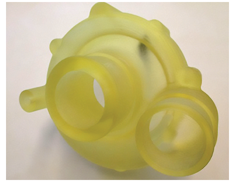
VCE 3D printed this water pump housing in Transparent material for quick functional testing.