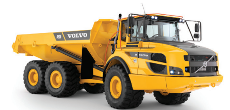
A Volvo A30G Articulated Hauler.